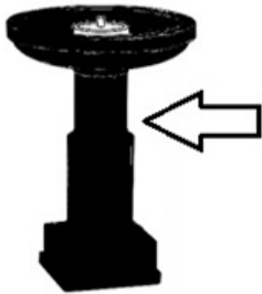
FT-106B (92 lbs) 18.25"W x 25.25"H

Assemble your fountain on a level surface capable of holding a minimum of 134 lbs with an approximate 6 sq. in. footprint (actual dimensions 9.5" x 9.5").