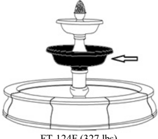
FT-124F (327 lbs) 47"W x 6.5"H