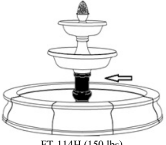
FT-114H (150 lbs) 15.5" L x 15.5"W x 18"H