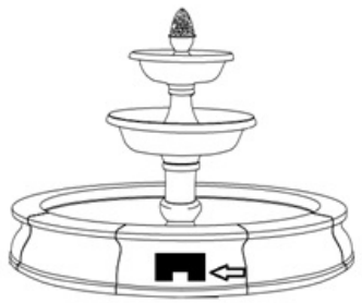
FT-239J (242 lbs) 20"L x 20"W x 12"H