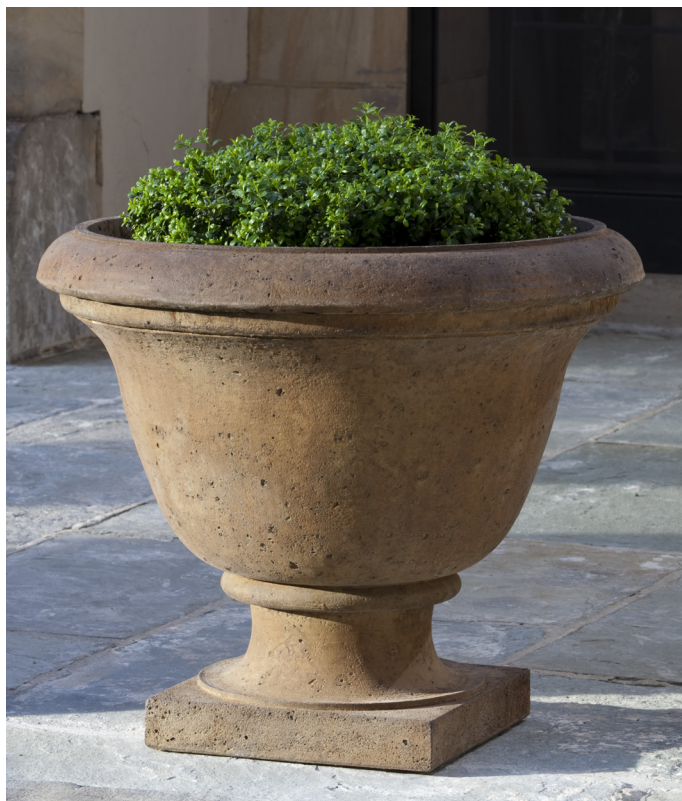
Shown in Pietra Nuova

Available in a choice of thirteen (13) exclusive natural pigment stains in addition to natural. All of our patinas are hand applied in a multi-step process which produces unique and beautiful surface finishes. Designed to replicate the look of naturally aged materials, the patinas will not prevent the natural aging process that occurs in an outdoor environment. Rather than creating uniform stains, our approach gives our products their unique beauty and appeal.