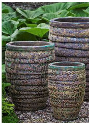
Shown in Angkor Green Mist