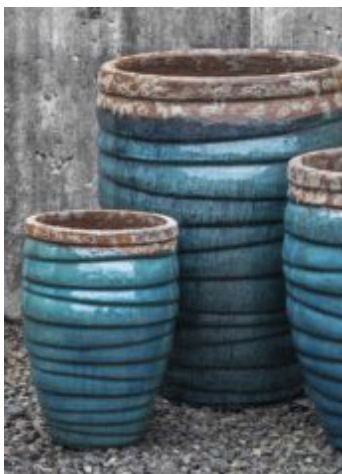
Shown in Beachcomber Aqua