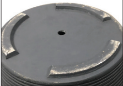
Detail of pot feet

Cleaning Instructions: Campania Lite® planters can be cleaned with either water or Windex® with Ammonia-D. Spray down the surface of the planter where it is dirty and use a lint-free cloth or sponge to wipe the surface. Note that it may take several cycles of wiping and drying before the planter is completely clean. This is normal and to be expected with the texture in the fiberglass. Do not pressure wash, use alcohol based cleaners, apply corrosive cleaners or clean with anything abrasive.