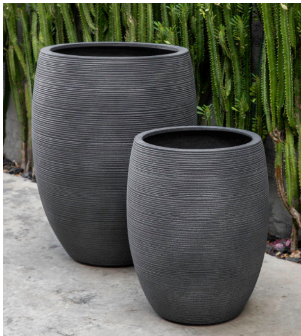
Shown in Lead