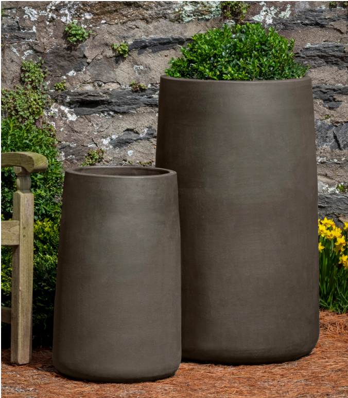
Shown in Peat