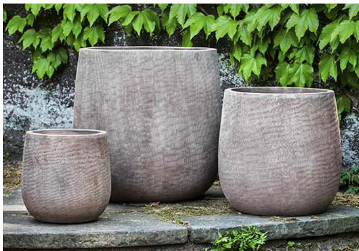
8625-6603 shown in Antico Terra Cotta

Terra Cotta Collection Campania's glazed and terra cotta planters are hand made from natural clay using traditional artisanal techniques and high-fired at temperatures between 990-1000 degrees centigrade to ensure frost resistance and durability.