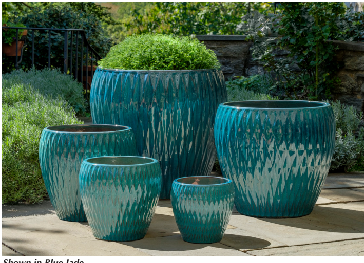
Shown in Blue Jade