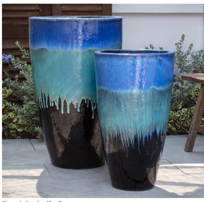
Shown in Running Blue/Brown