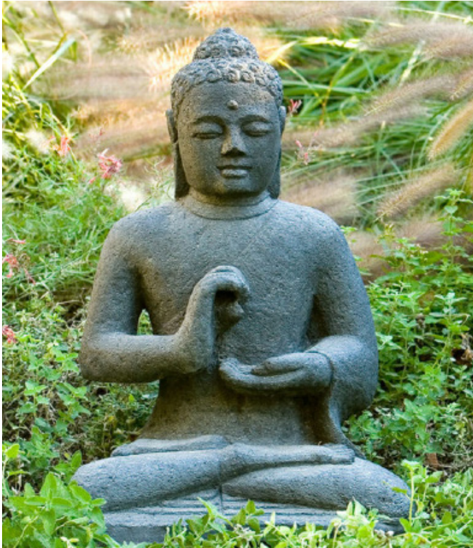
Shown in Nero Nuovo

Cast stone products in the USA using locally sourced materials. All of our cast stone pieces are manufactured using the wet casting technique with a proprietary high density cast stone mix, yielding a PSI strength of approximately 7,500. The mix is comprised primarily of water, sand, stone aggregate and cement. Our cast stone products may qualify for LEED credits as applicable to your project. Cast stone produces a strong and durable product that will weather naturally in an outdoor environment. Simply stated, cast stone is chosen for its beauty and authenticity. Our material is natural, authentic, made in the USA, and 100% recyclable.