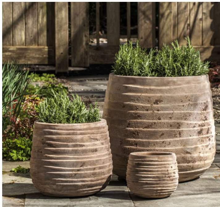
Shown in Antico Terra Cotta