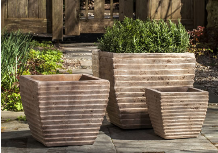
Shown in Antico Terra Cotta