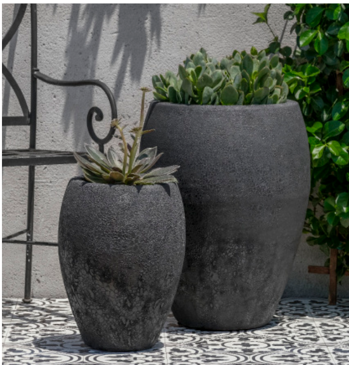
Shown in Volcanic Coral