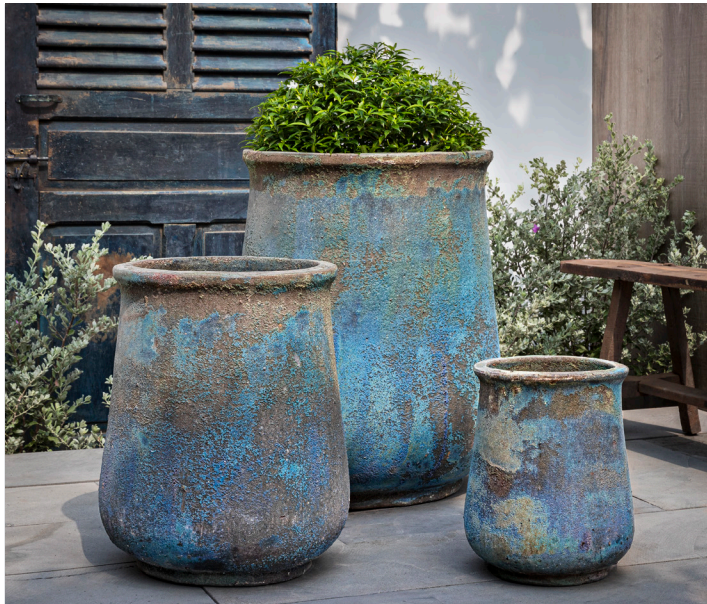
Shown in Blue Verdigris