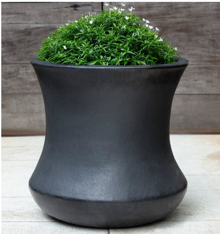
Shown in Graphite