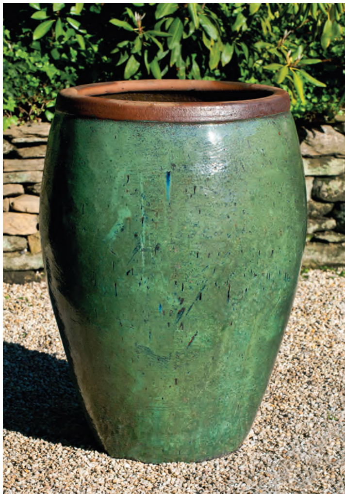
Shown in Rustic Green