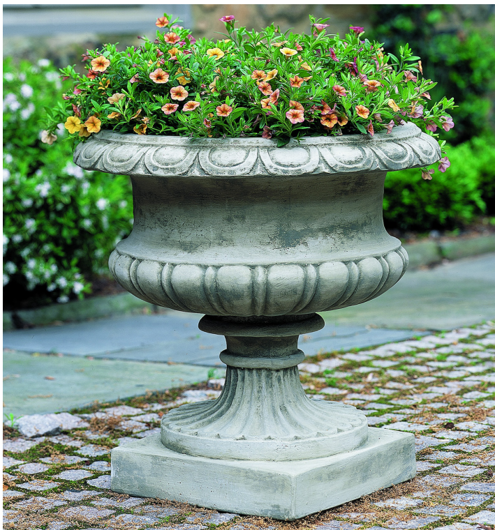
Shown in Greystone