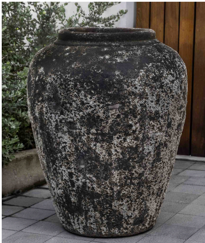
Shown in Aegean