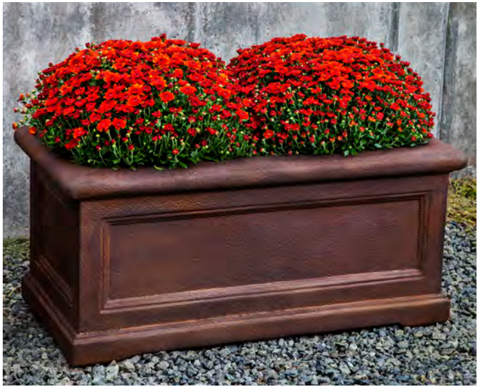
Shown in Pietra Nuova