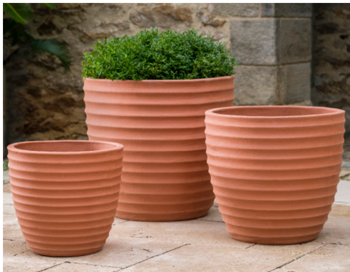
Shown in Terra Rosa