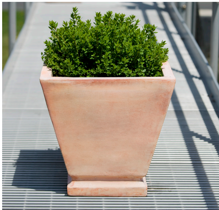
Shown in Terra Cotta