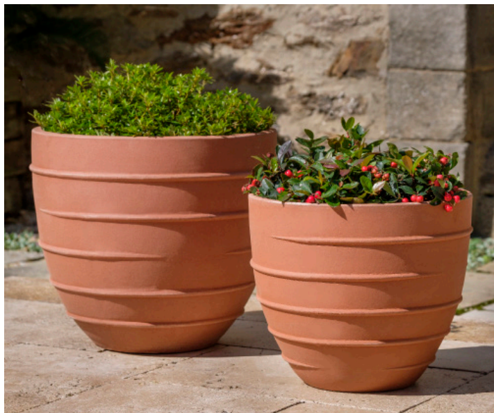
Shown in Terra Rosa