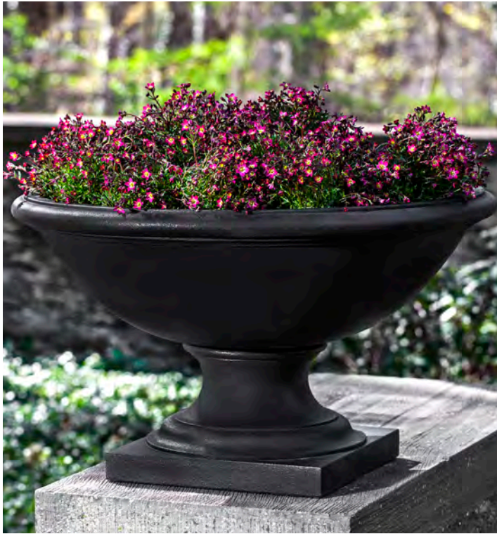
Shown in Nero Nuovo

Available in a choice of thirteen (13) exclusive natural pigment stains in addition to natural. All of our patinas are hand applied in a multi-step process which produces unique and beautiful surface finishes. Designed to replicate the look of naturally aged materials, the patinas will not prevent the natural aging process that occurs in an outdoor environment. Rather than creating uniform stains, our approach gives our products their unique beauty and appeal.