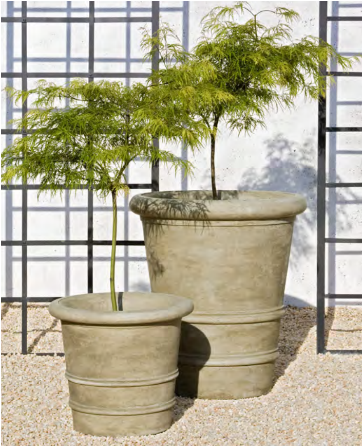
Shown in Verde