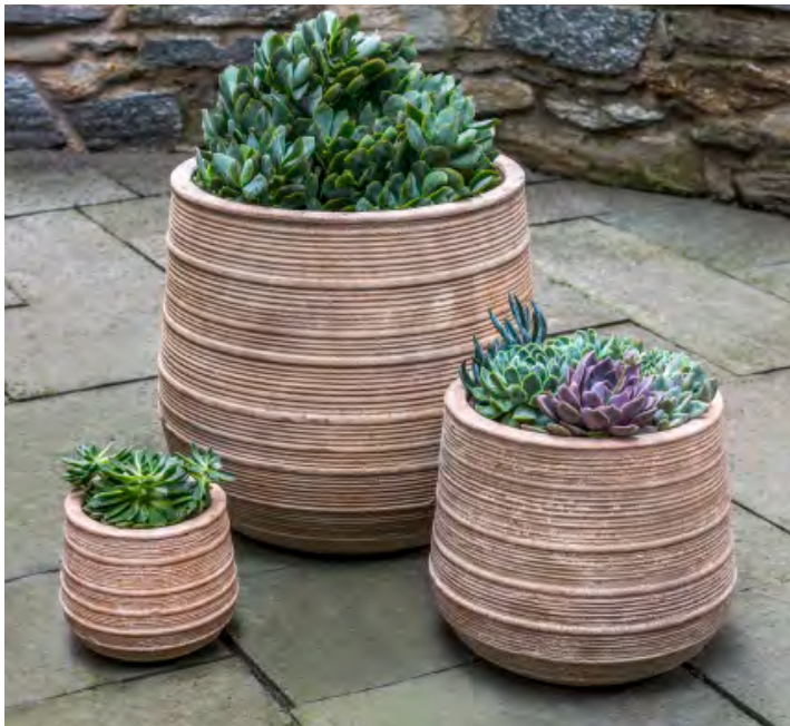
Shown in Antico Terra Cotta