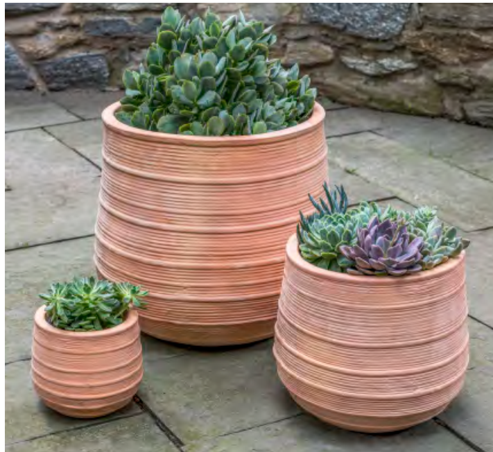
Shown in Terra Cotta