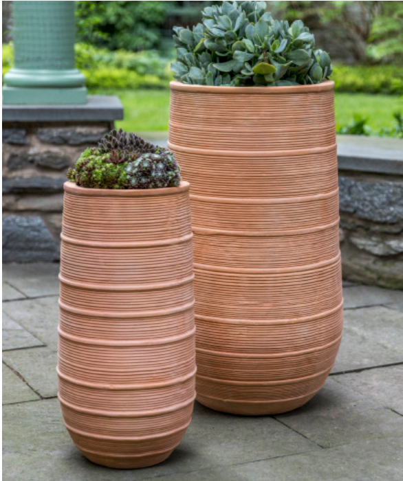
Shown in Terra Cotta