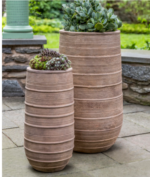
Shown in Antico Terra Cotta