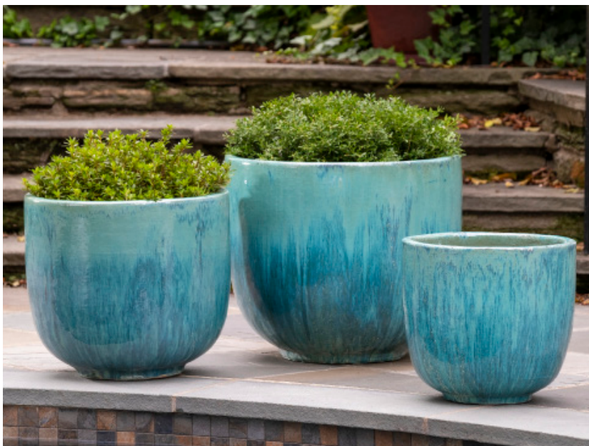
Shown in Antigua