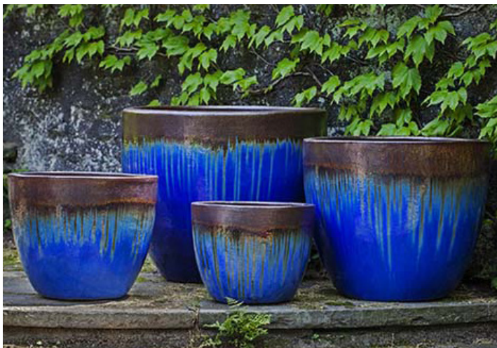
Shown in Bronze Blue