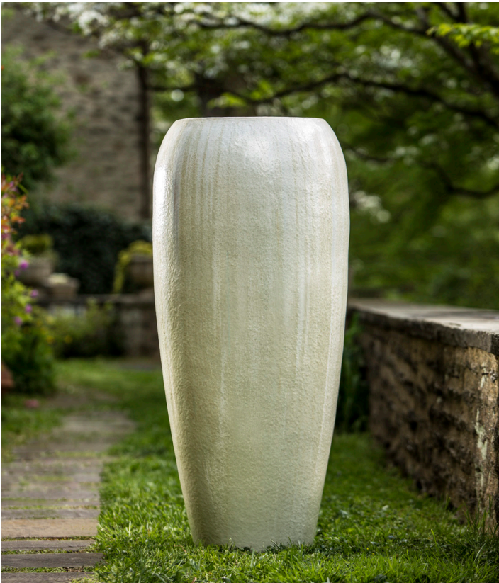
Shown in Antique Pearl