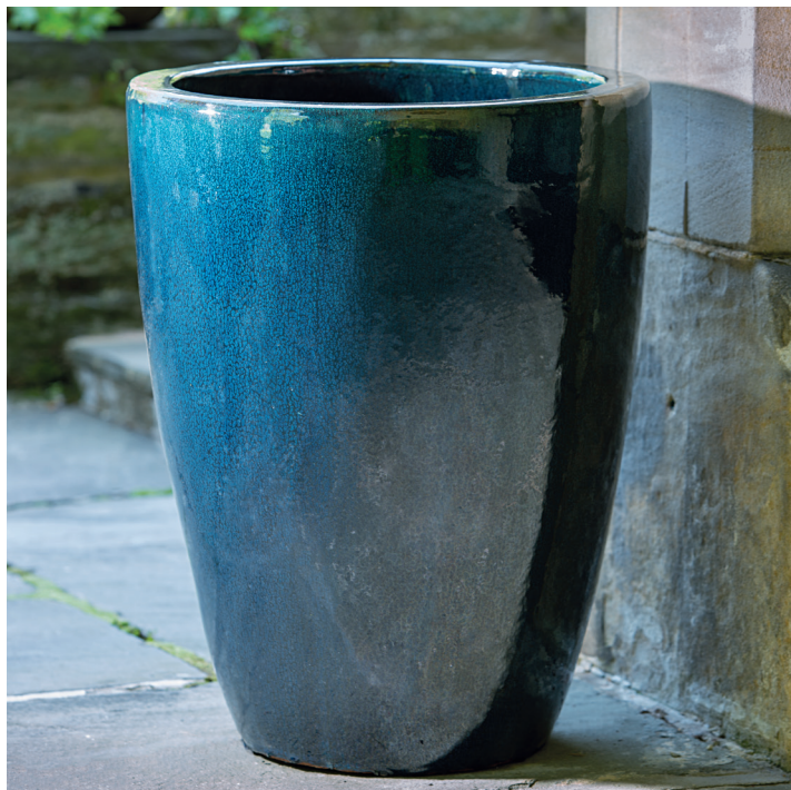
Shown in Indigo Rain