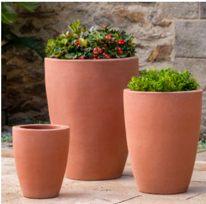
Shown in Terra Rosa