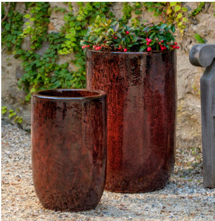
Shown in Cabernet