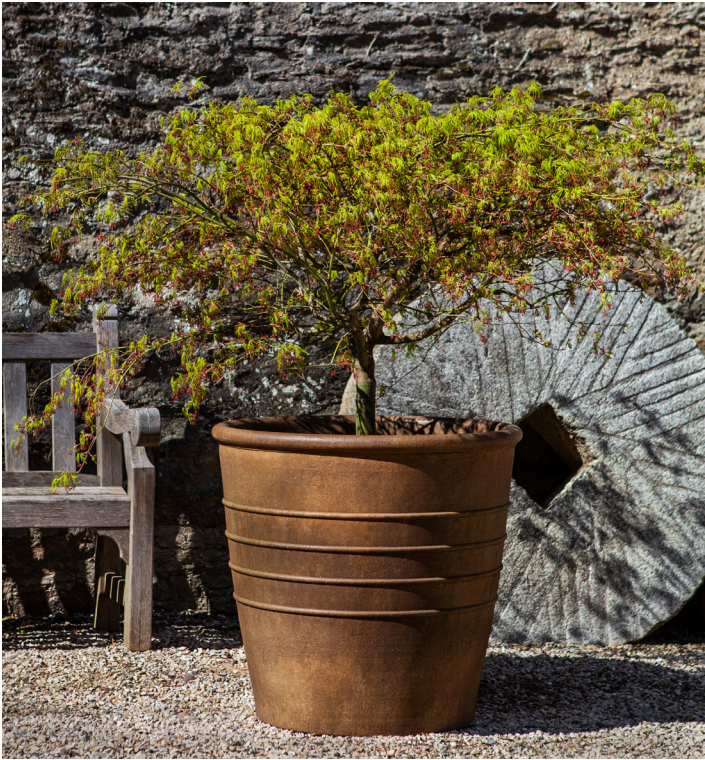
Shown in Pietra Nuova