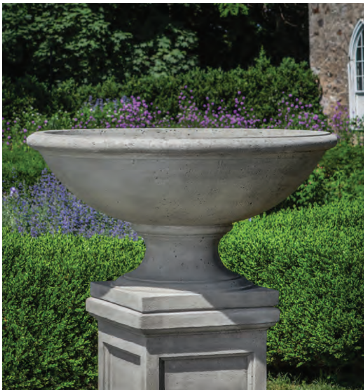
Shown in Alpine Stone on St. Louis Pedestal PD-197