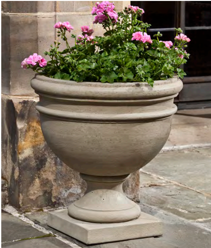
Shown in Verde