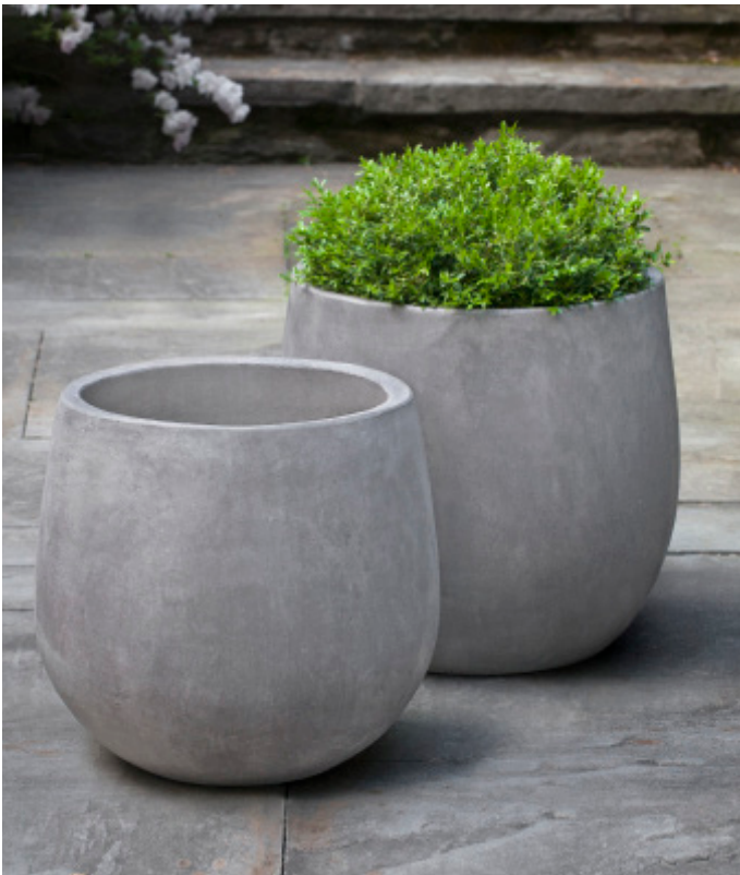
Shown in Alpine Stone