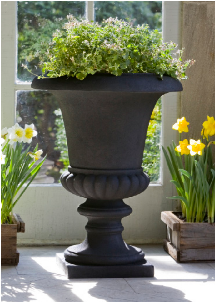
Shown in Onyx Black