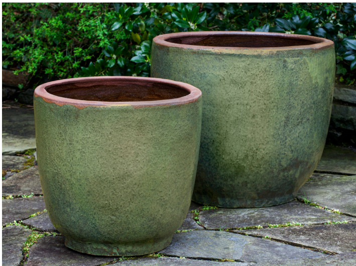
Shown in Rustic Green