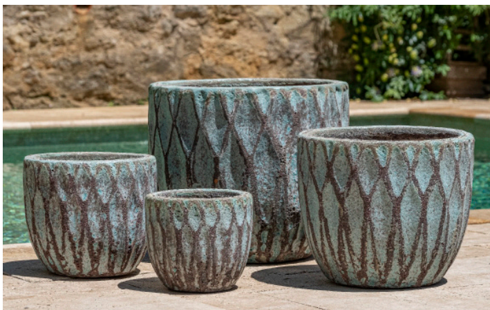
Shown in Verdigris