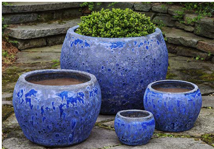
Shown in Angkor Blue