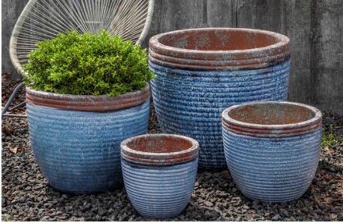
Shown in Beachcomber