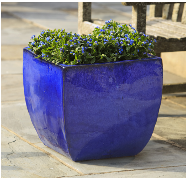
Shown in Riviera Blue