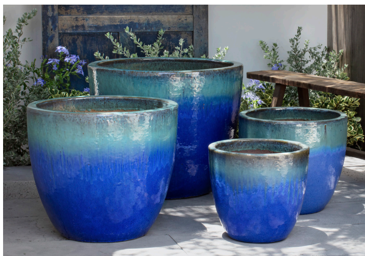
Shown in Running Aqua