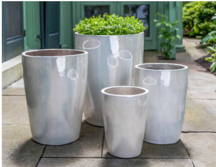
Shown in Pearl