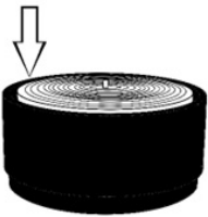
FT-429C (392 lbs) 39.75"W x 19"H

NOTE - The tubing assembly is marked at either end with a "P" or "W" to reference where it connects in the fountain.