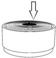
FT-429A (9 lbs) 10.5"W x 2.25"H

Step 8 - Center the top plate (FT-429AA) on the pump house (FT-429B) ensuring that it is level.