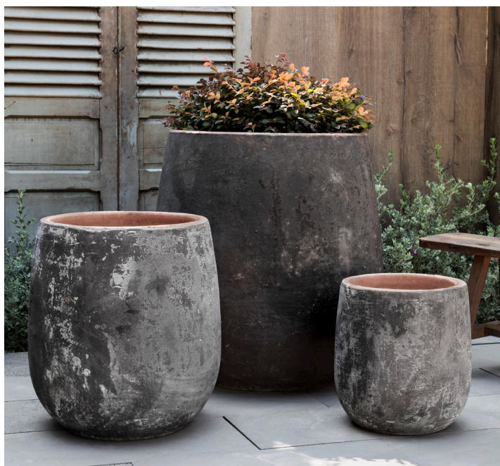
Shown in Vicolo Noir