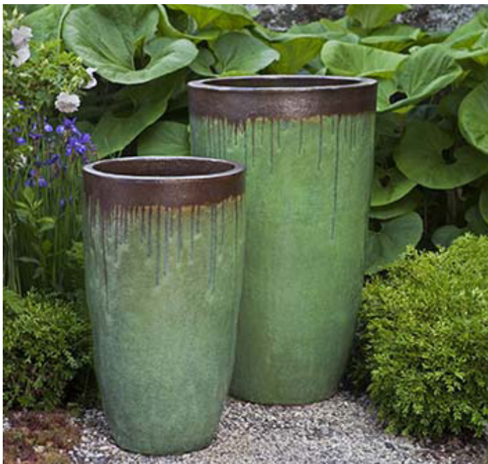
Shown in Bayou Bronze