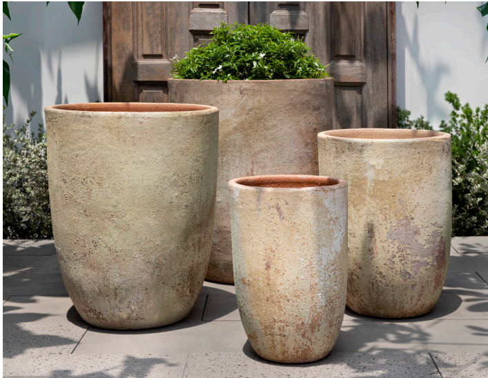
Shown in Vicolo Muro