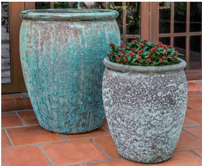
Shown in Verdigris