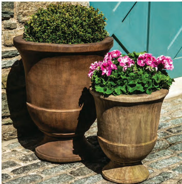
Shown in Pietra Nuova and Aged Limestone

Available in a choice of thirteen (13) exclusive natural pigment stains in addition to natural. All of our patinas are hand applied in a multi-step process which produces unique and beautiful surface finishes. Designed to replicate the look of naturally aged materials, the patinas will not prevent the natural aging process that occurs in an outdoor environment. Rather than creating uniform stains, our approach gives our products their unique beauty and appeal.